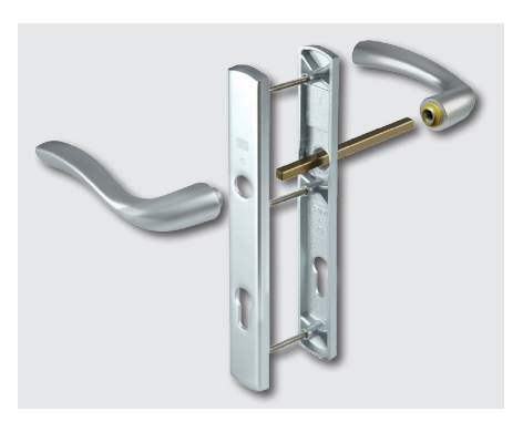
Handles incorporate Hoppe 'Quick-Fit technology